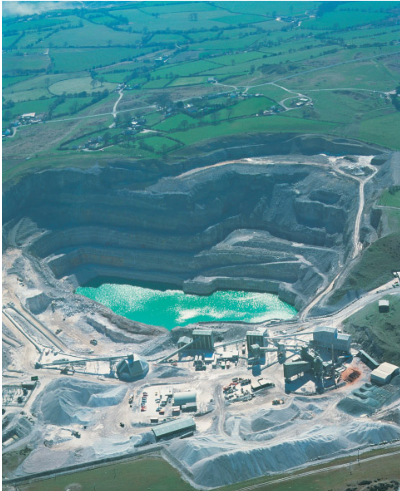
Information in the Register of Historic Landscapes should be taken into account by local planning authorities when considering the implications of developments which are on such a scale that they would have a more than local impact on an area on the Register. Quarrying on the scale of this existing quarry within the Holywell Common and Halkyn Mountain historic landscape would be an example of such a development.