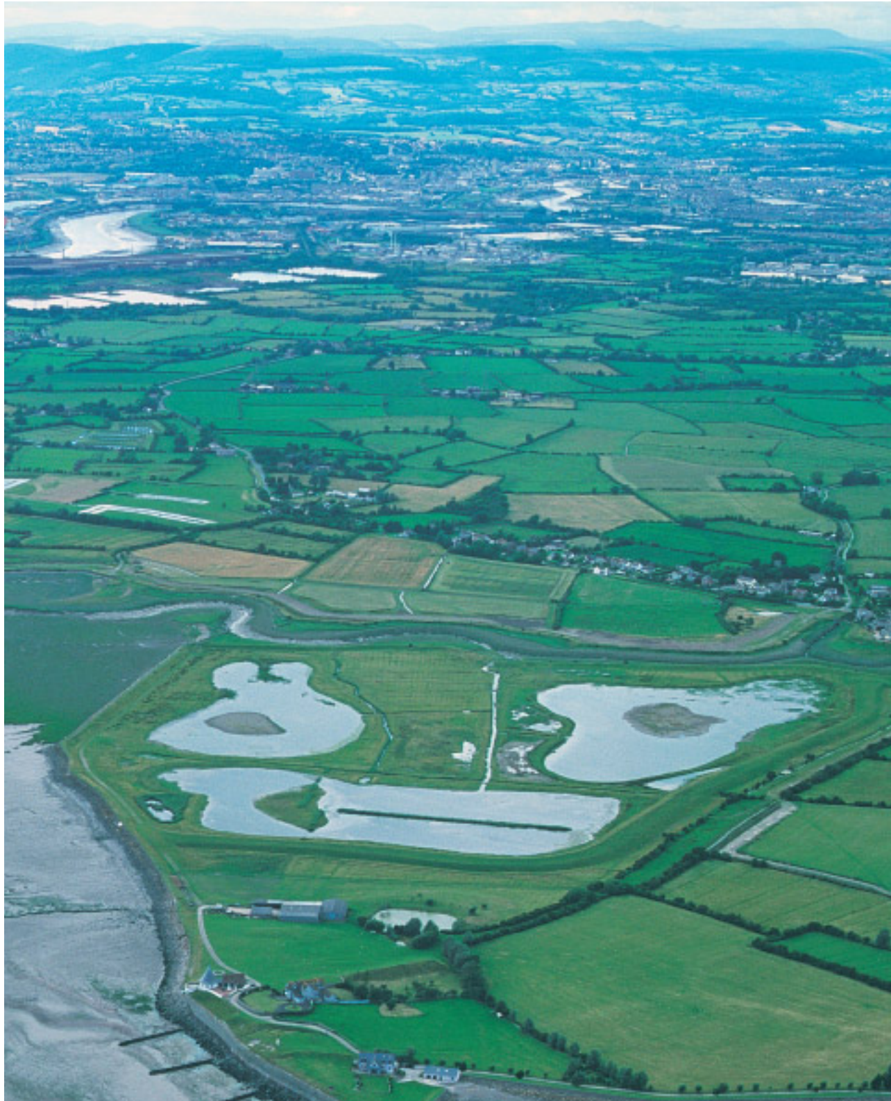
An aerial view of the lagoons and reedbeds of the Gwent Levels Wetland Reserve created to replace habitats lost when the Cardiff Bay Barrage was constructed. The reserve has been successfully integrated into the pattern of the Gwent Levels historic landscape.