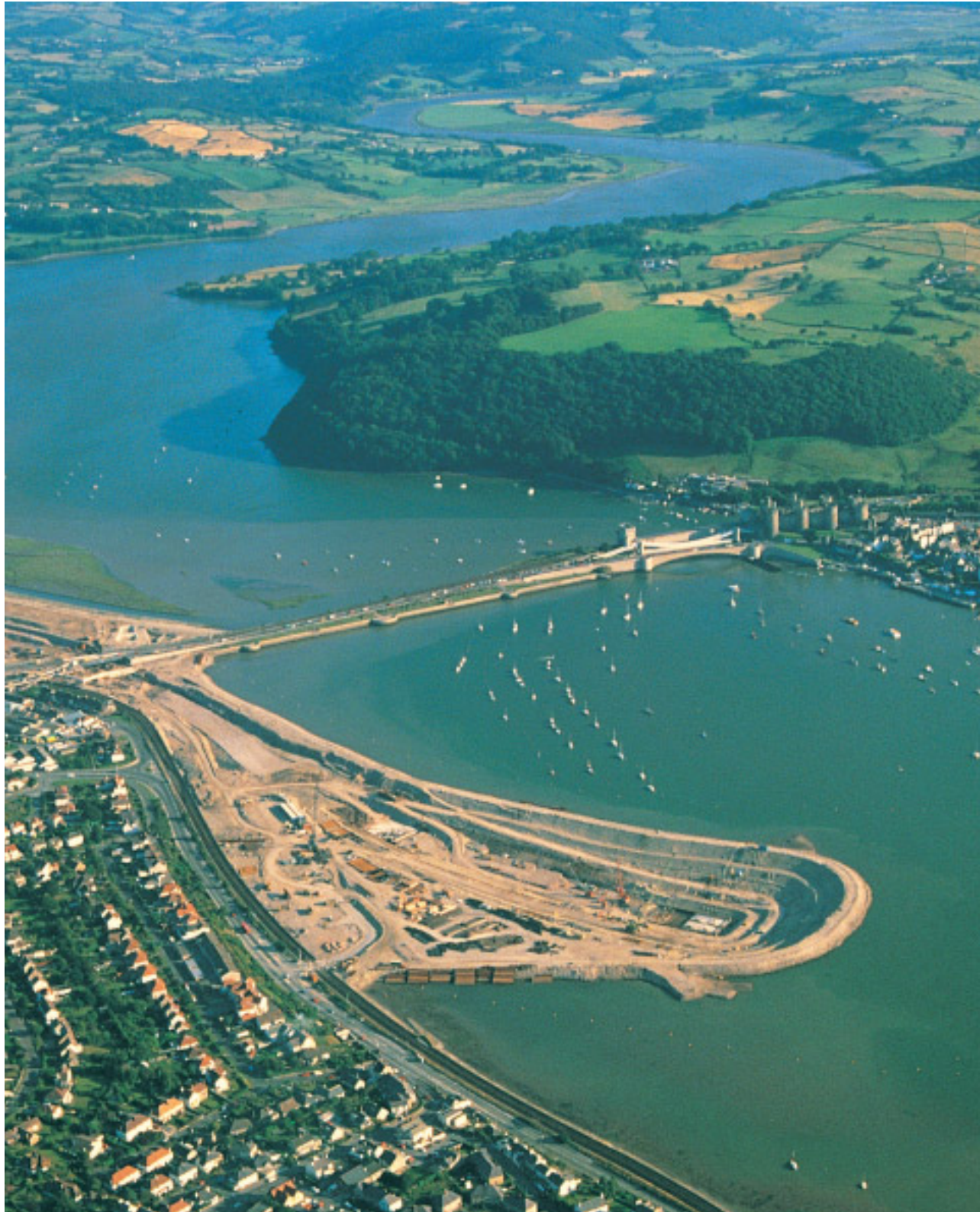
The decision in 1980 that the A55 trunk road should cross the River Conwy in a tunnel (here under construction) rather than by a bridge hard up against the world famous late thirteenth-century castle preserved both the spectacular setting of the castle and the essential cohesion of the Creuddyn and Conwy historic landscape.